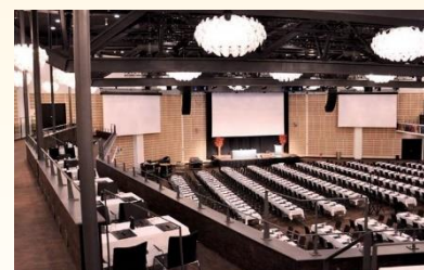
A preview of the venue.

Newsletter is issued in electronic form only by The International Society for Electroporation-Based Technologies and Treatments (ISEBTT).