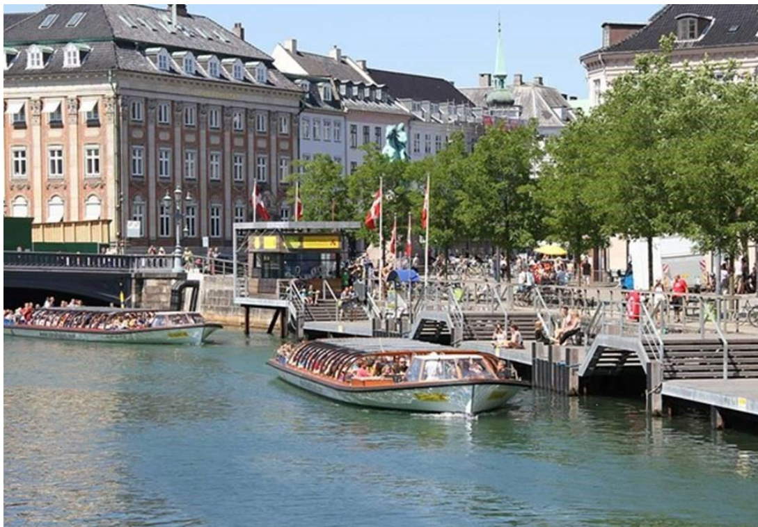
The Welcome reception on October 9 th will be a cruise of the Copenhagen harbor.

To those who did not yet register: Registration is open anytime – but the rate is lower if you register before September 5 th ! To register, visit the Registration page of the World Congress website, available at https://wc2022.electroporation.net/registration .